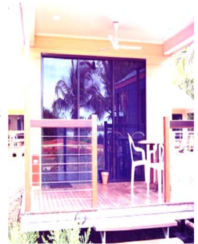
1 bedroom cabin at Hay Point Beach Tourist Park

People working on the project needing to source accommodation locally, which can be quite difficult given the tight local real estate market, can contact the project site on 4940 9440.