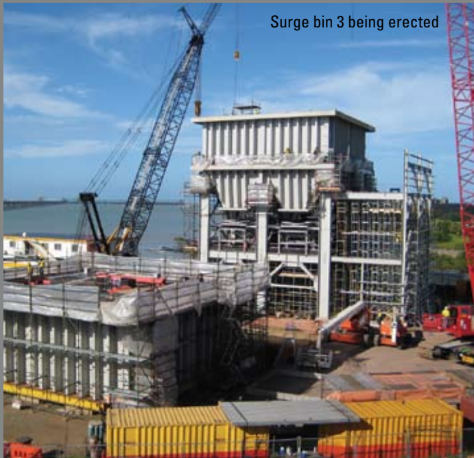
Surge bin 3 being erected