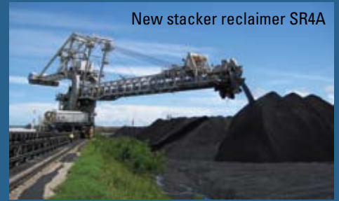
New stacker reclaimer SR4A