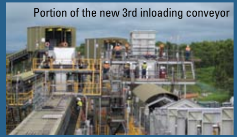
Portion of the new 3rd inloading conveyor