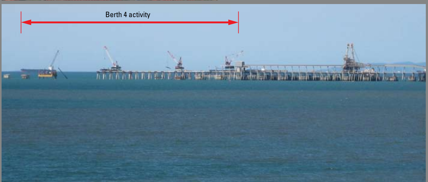
Berth 4 activity