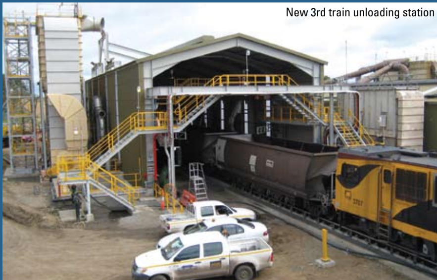
New 3rd train unloading station