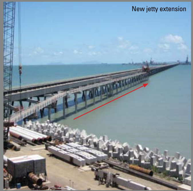
New jetty extension